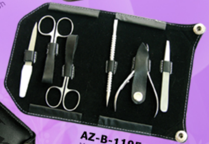
AZ-B-1195 Manicure kit with 6 Pcs