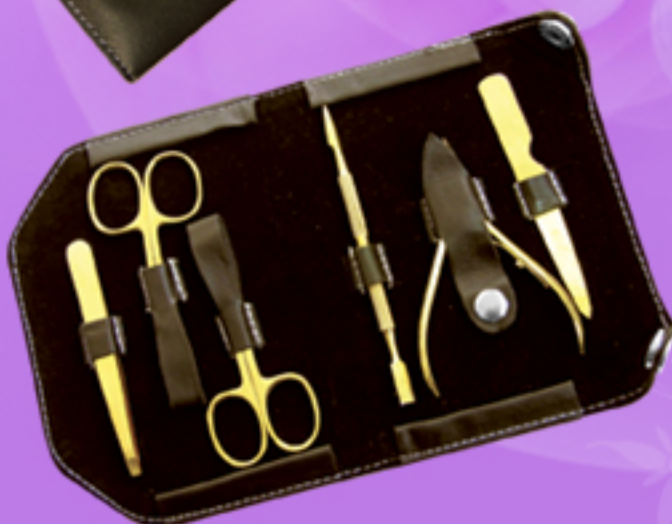
AZ-B-1197 Manicure kit Full Gold Plated