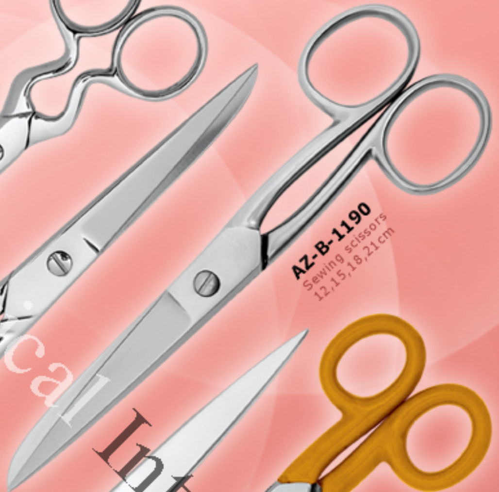
AZ-B-1190 Sewing scissors 12,15,18,21cm