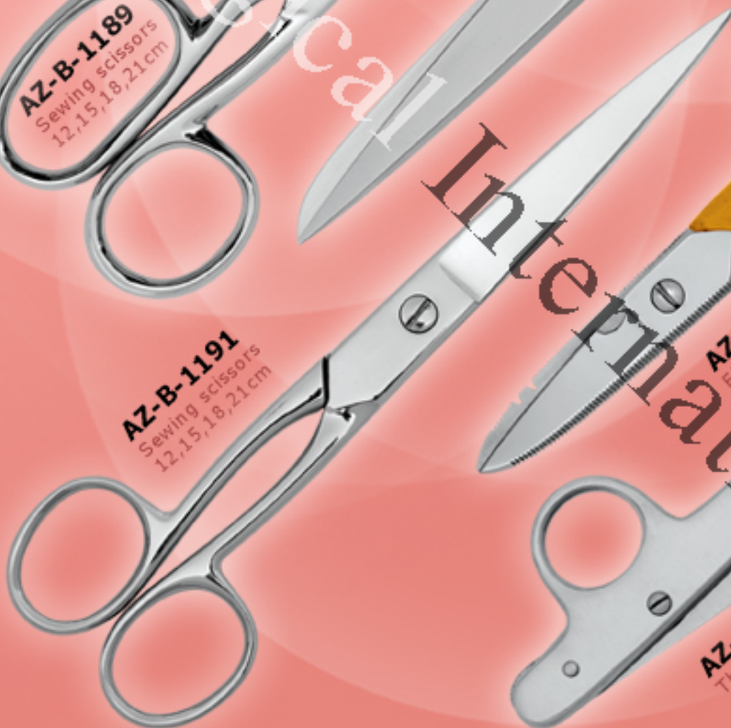
AZ-B-1191 Sewing scissors 12,15,18,21cm