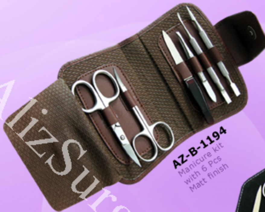
AZ-B-1194 Manicure kit with 6 Pcs Matt finish