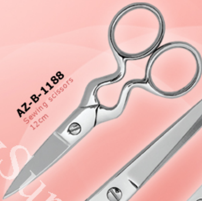
AZ-B-1188 Sewing scissors 12cm