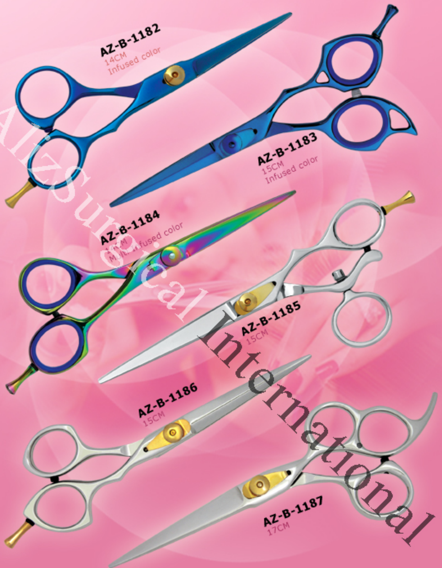
AZ-B-1182 14CM Infused color